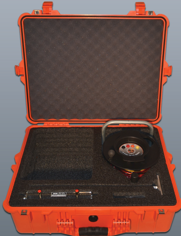
Soil Resistivity Test Kit Item #156226