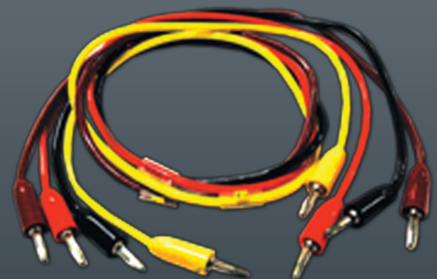
4-Pin Test Reel Lead Set (4FT) Item #44698