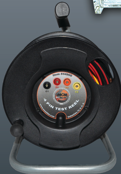
4-Pin Test Reel Item #44900