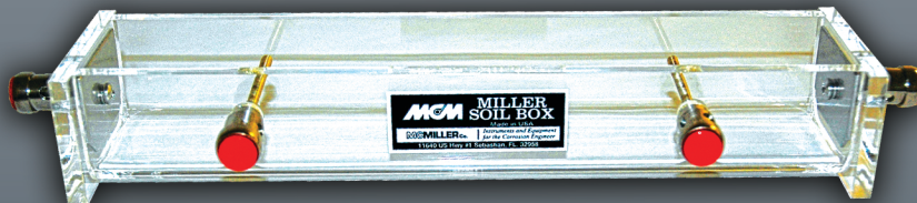
Large Soil Box (270 ml) Item #37008