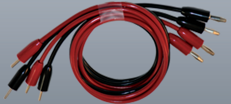
Soil Container Test Leads(4 FT) Item #37010