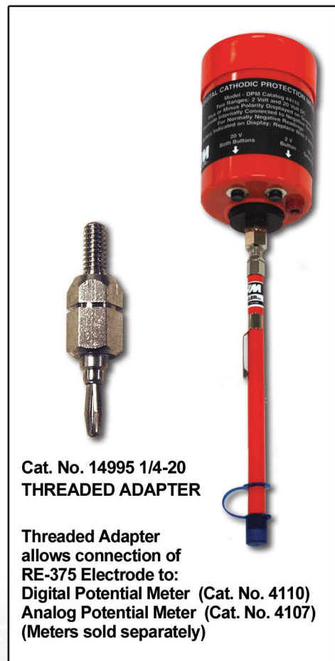
Cat. No. 14995 1/4-20 THREADED ADAPTER

Length can be extended by the insertion of additional extension rods, either: 15" long ( Cat. No. 16225 ) or 30" long ( Cat. No. 16230 )