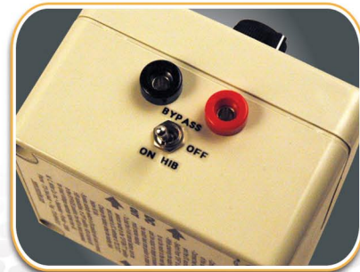
Model M-3-A2 Multimeter Cat. No. 5615