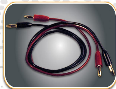
Included red and black test leads Cat. No. SIN008

When structure-to-soil readings are taken across highly resistive materials such as dry soil, sand, rock and concrete, readings can appear lower than their actual values. Relying on such low readings can lead to over compensation of the rectifiers' output, over protection of the structure, and wasted resources.